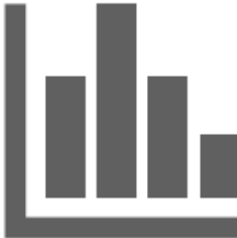
Total energy consumption/generation