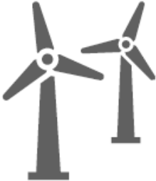
Renewable energy generation