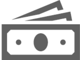
Utility cost & savings