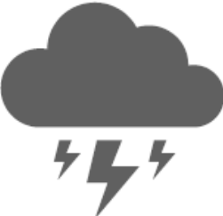
Weather: storms, temperature, precipitation