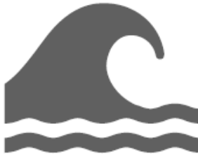
Sea level rise: potential and flooding