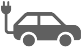
ZEV & State green-fleets

What do different states track on their dashboards?