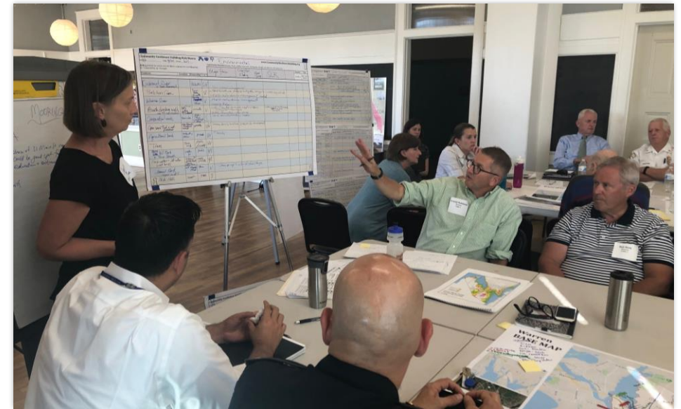
Community Resilience Building Workshop, 2019