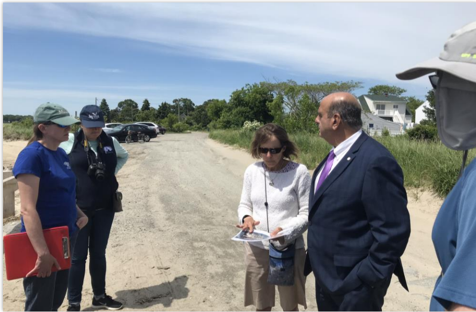
CRMC, URI, Save the Bay, and City of Warwick collaborate on resilient solutions at Oakland Beach – SAID Program, 2019

Three Core Goals: Elevation, Collaboration, and Transparency